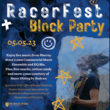
Graphic courtesy of Alumni Relations RacerFest is a first time celebration, hosted by multiple campus organizations.