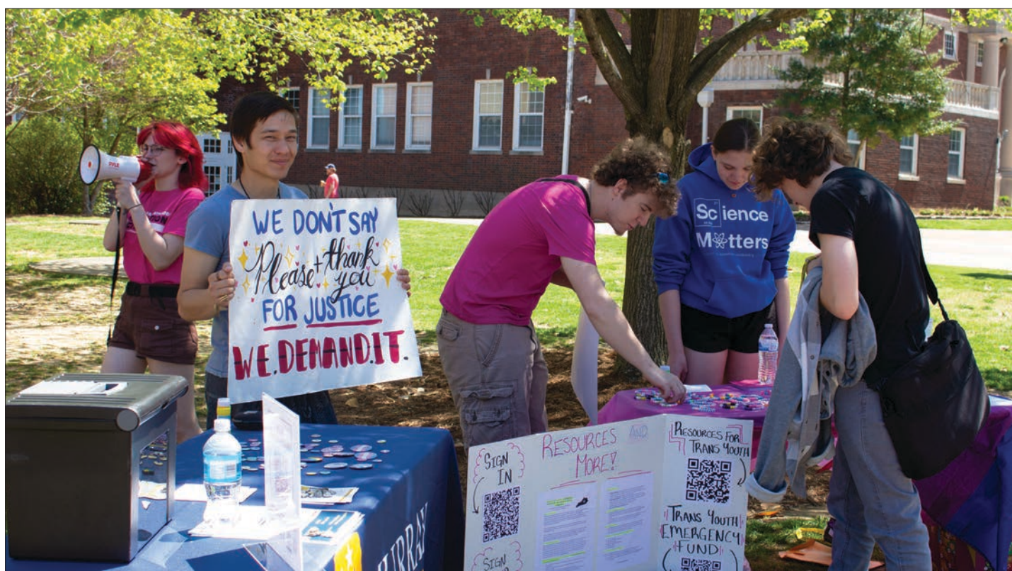
The Murray State Planned Parenthood Generation Action Chapter hosts a rally on Tuesday, April 11 to inform the campus of ways to support Trans Youth in Kentucky.