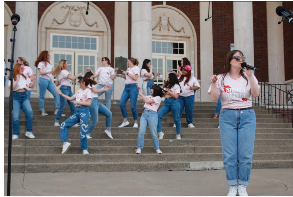
Sigma Alpha Iota puts on a show at the 2023 All Campus Sing.

People to People provide material assistance and encouragement to schools, music organizations and musicians.