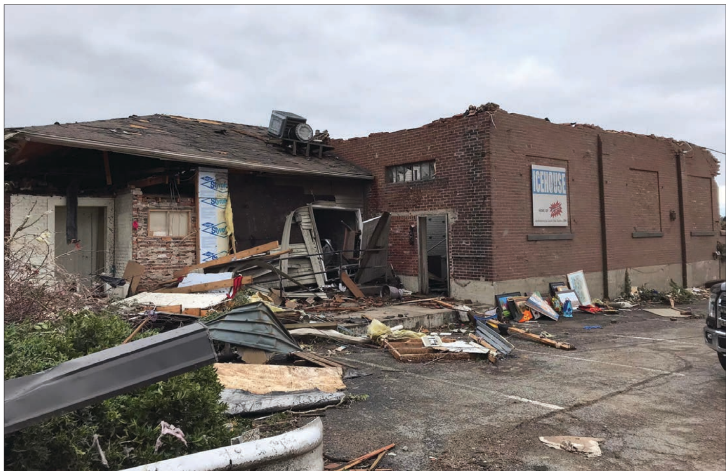
The original Ice House Gallery facility was destroyed in the tornado that came through Mayfield on Dec. 10, 2021.

Submissions are open to anyone who is interested. Submitted works can be any medium, so long as they are 5.5" by 8.5" or smaller. The artwork can be submitted at the