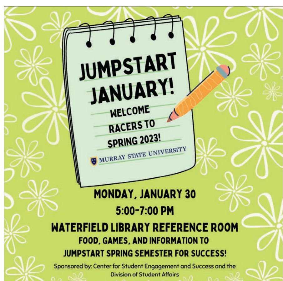
Jumpstart January is the first event in a monthly series hosted by Racers Empower.

At the Mindful March event, students will learn how to review their midterm grades and meet with their academic advisor. The Active April event stresses the importance of exercise for a healthy