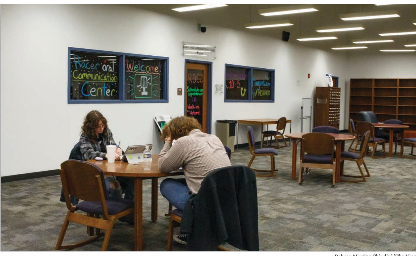
A feeder pipe to the sprinkler system in Waterfield Library burst resulting in flooding on the south side of the building on Christmas Day.