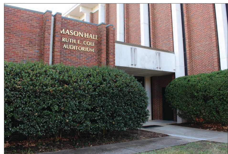
The workforce grant set to launch in Spring 2023 supports frontline healthcare training.