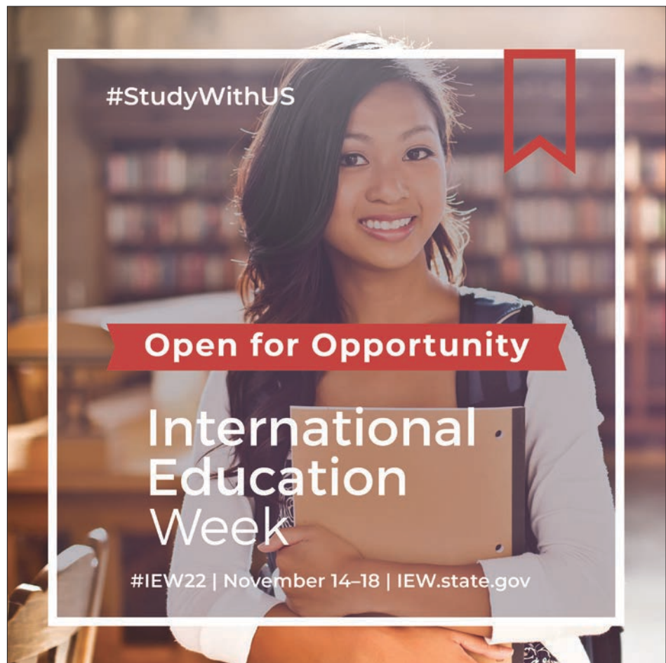
International Education Week is celebrated at universities across the country from Nov. 14-18.