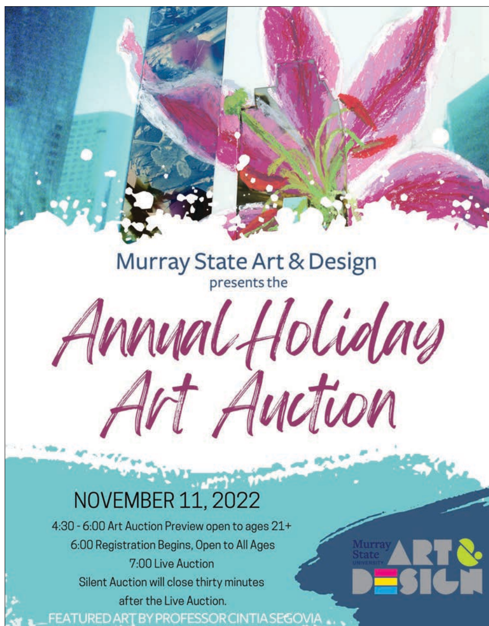
The annual Holiday Art Auction will be held Friday Nov. 11 at 4:30 p.m. in the Eagle Gallery.