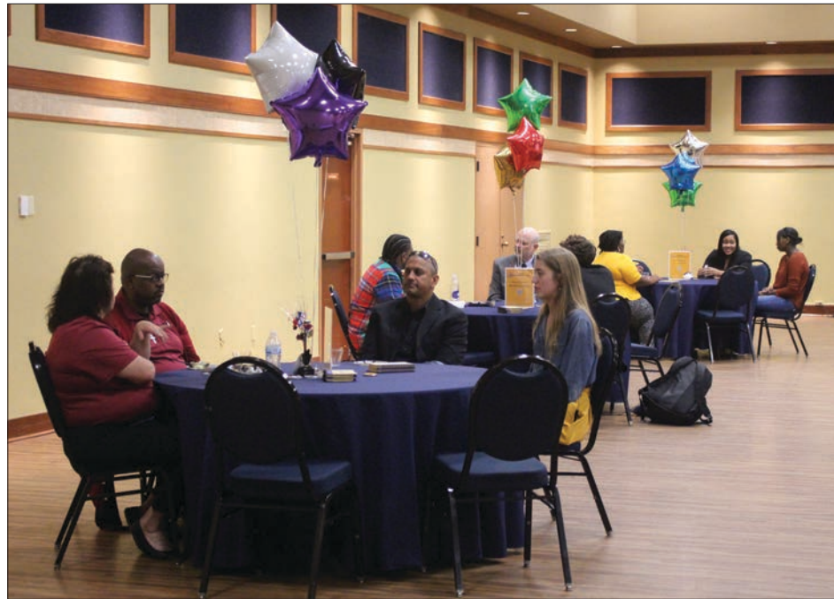
Attendees mingle at conversation tables mixed with students and staff members.

After she was notified that she would be receiving the scholarship, she wrote a letter that was read to