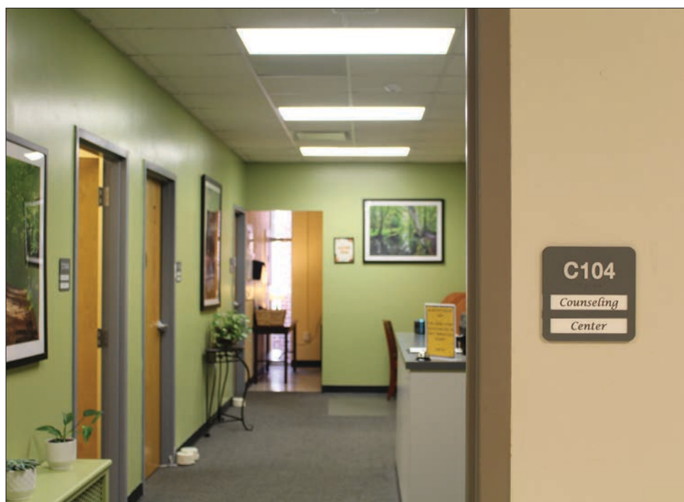
The Counseling Center is located in Room c104 in the Oakley Applied Science Building.

"We can't really expect just the Counseling Center to be the only people on campus who deal with