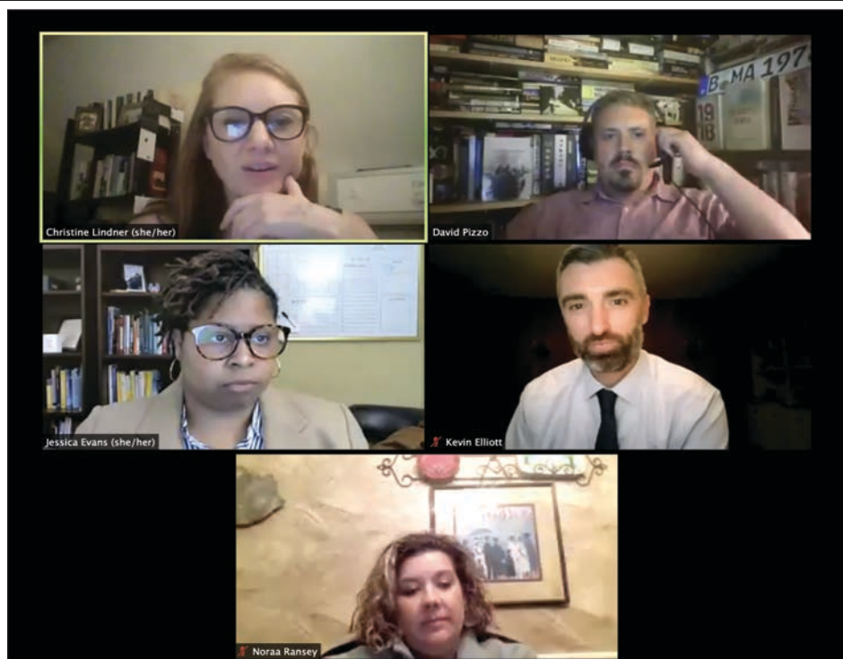
Screen capture of the panel on Zoom. The panelists plan to have another webinar about Critical Race Theory in January.

The panelists felt the need to host a discussion about Critical Race Theory (CRT) because of the increasing amount of misinformation and misinterpretation of CRT. The panelists also cited they felt an increased need for this discussion following a series of columns about CRT that appeared in the Murray Ledger & Times.